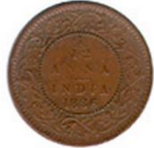
Half Pice, Bronze