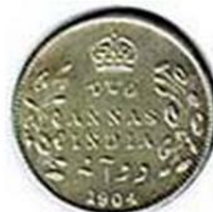
One Fourth Rupee, Silver